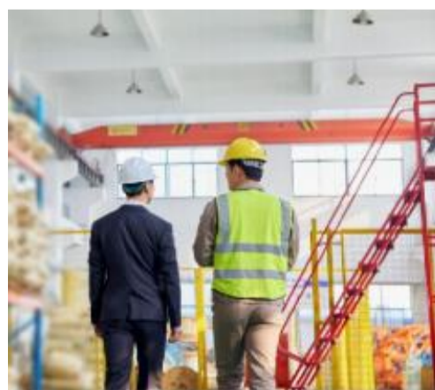
Warehousing and Logistics